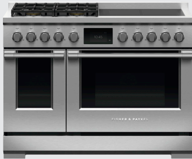
A FREESTANDING RANGE 30", 36" OR 48"