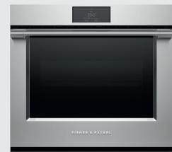
AND A BUILT-IN OVEN 24" OR 30"