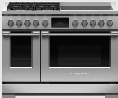
A FREESTANDING RANGE 30", 36" OR 48"