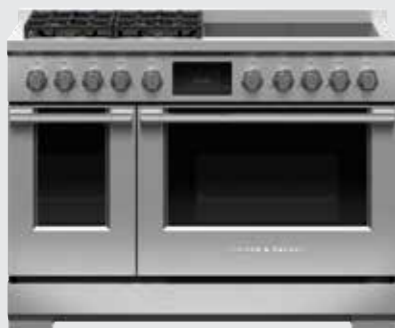
FREESTANDING RANGE 30", 36" OR 48"

GET A BONUS GIFT A DISHDRAWER™ DISHWASHER OR DISHWASHER