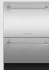
UPGRADE TO A DOUBLE DISHDRAWER™ DISHWASHER* *Additional cost depending on chosen model.