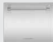
SINGLE DISHDRAWER™ DISHWASHER

GET A BONUS GIFT A DISHDRAWER™ DISHWASHER OR DISHWASHER