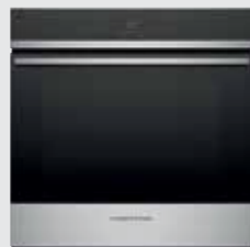
BUILT IN OVEN 24" OR 30"