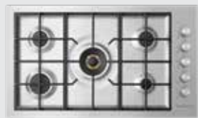
COOKTOP 24", 30" OR 36"

PURCHASE A NEW FREESTANDING RANGE OR BUILT-IN OVEN AND COOKTOP COMBINATION