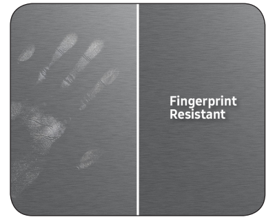
Fingerprint Resistant Finish