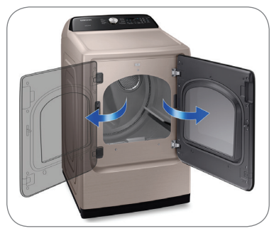
Reversible Dryer Door