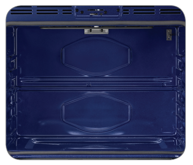
Blue Ceramic Interior