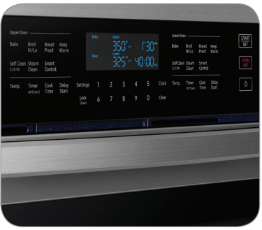
Digital Touch Controls

Fingerprint Resistant Black Stainless Steel