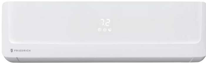
FPHFW18A3A, FPHFW24A3A, FPHFW18A3B, FPHFW24A3B

The contractor’s line with extensive features to make installation and service faster and easier. Exceptional efficiency and dependable performance.