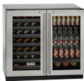
STAINLESS FRAME (LOCK)