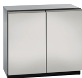
INTEGRATED SOLID (STAINLESS HANDLELESS PANEL)*