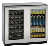
INTEGRATED FRAME (STAINLESS HANDLELESS PANEL)*