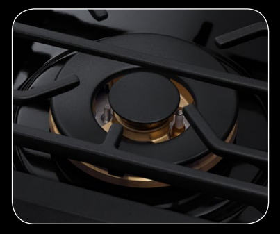
22K Brass Dual Power Burner

*With compatible Samsung ventilation hood.