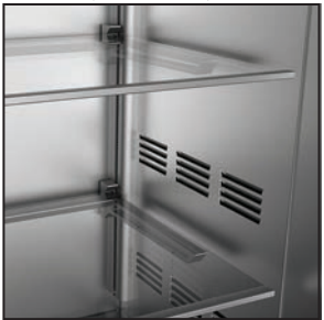
Adjustable Shelf System