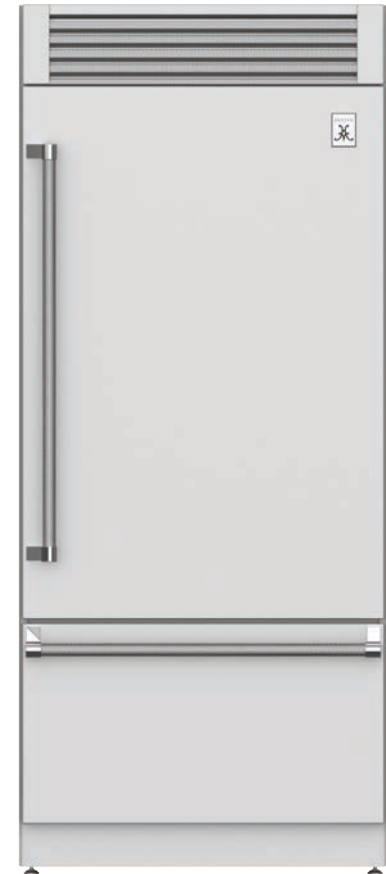
Model as shown KRPR36