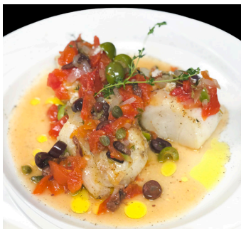
Family sized 2.2 cu. ft. capacity, to cook and reheat larger portions of food

With decades of experience designing smart, innovative microwaves, it's easy to see why home cooks throughout the world trust Sharp Carousel.