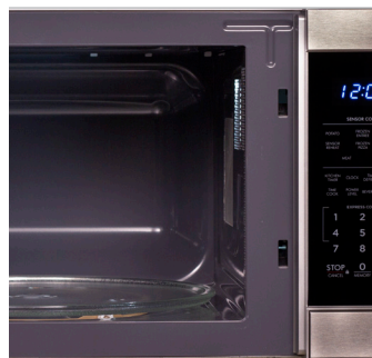
Elegant, gray interior complements the stainless steel finish