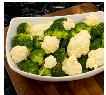
Sensor cook menu for precise cooking and reheating

SHARP ELECTRONICS CORPORATION 100 Paragon Drive, Montvale NJ, 07645 1.800.237.4277 • www.sharpusa.com