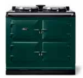
BRITISH RACING GREEN