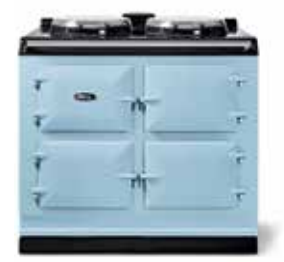
DUCK EGG BLUE