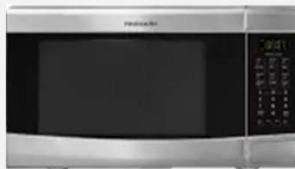
Green LED Display