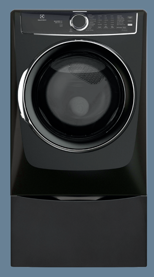
* Please note your model may look slightly different than pictured.